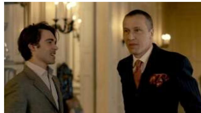
Grand Street (USA) – North American Premiere