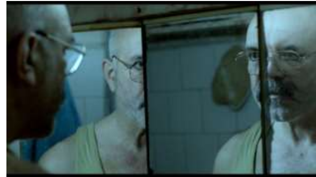
I'M Not Him (Turkey) – Canadian Premiere.